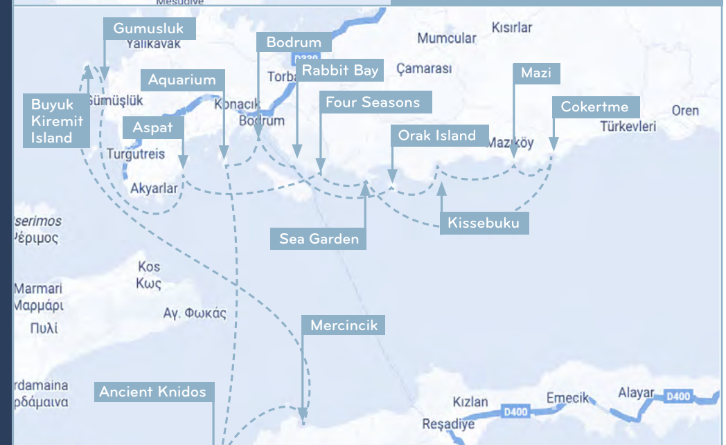
WEST GOKOVA ITINERARY